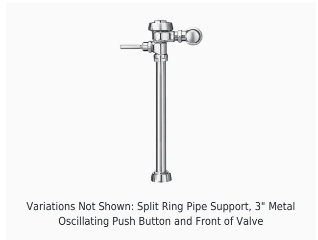
Variations Not Shown: Split Ring Pipe Support, 3" Metal Oscillating Push Button and Front of Valve